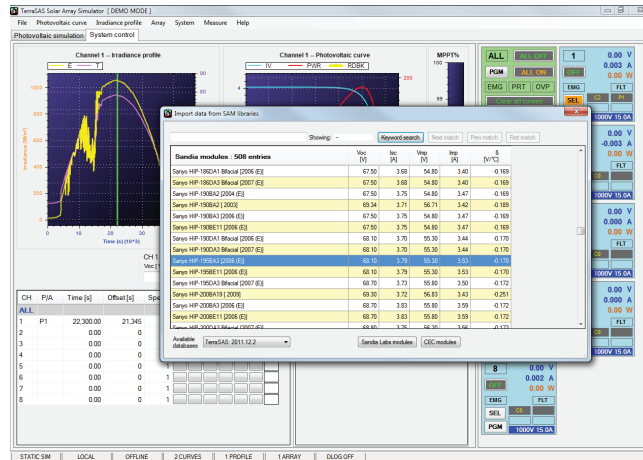
Photovoltaic array modeling

Import module data from embedded Sandia database and create I-V Curve